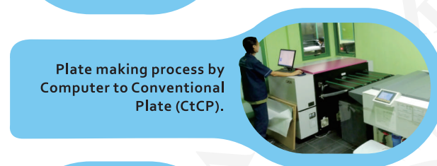
Plate making process by Computer to Conventional Plate (CtCP).