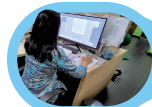
Typesetting and graphic design.