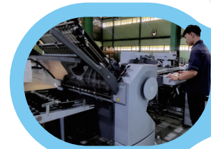
Sheet folding process using Stahlfolder machine.