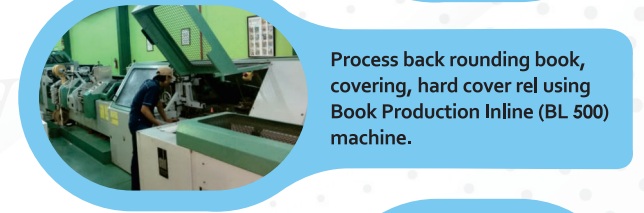
Process back rounding book, covering, hard cover rel using Book Production Inline (BL 500) machine.