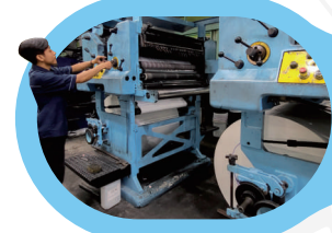
Printing on thin paper (24-40 gsm) using a high-speed web printing machine.