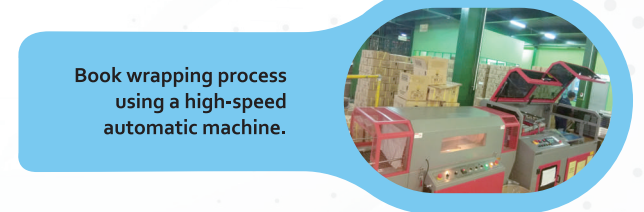
Book wrapping process using a high-speed automatic machine.