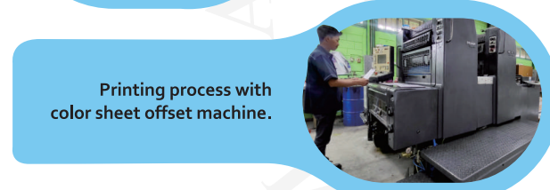
Printing process with color sheet offset machine.