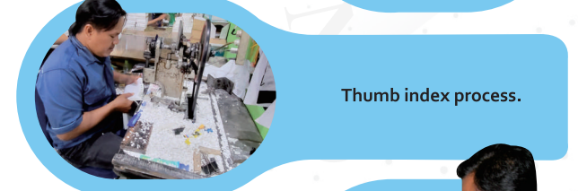
Thumb index process.