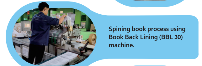
Spining book process using Book Back Lining (BBL 30) machine.