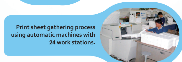
Print sheet gathering process using automatic machines with 24 work stations.