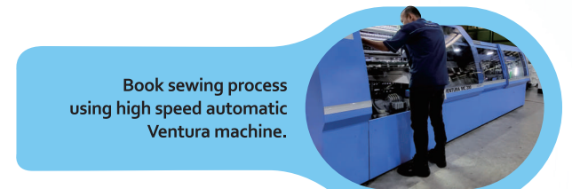
Book sewing process using high speed automatic Ventura machine.