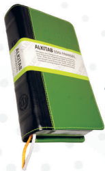
The Financial Stewardship Bible