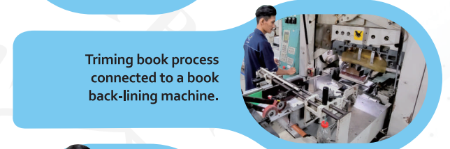
Trimming book process connected to a book back-lining machine.