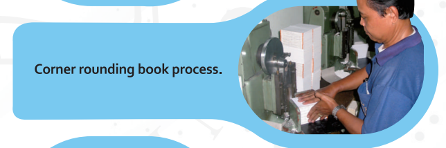
Corner rounding book process.