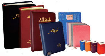
Bibles in various sizes